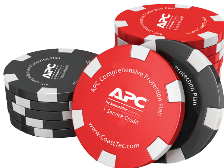
CoastTec CPP – Because downtime is not in your DNA

In addition to ease of fulfillment, the CPP offers purchasing ease. One P.O. covers service for the year. There are no fire drills and you're prepared for anything. We even offer remote monitoring and onsite service.