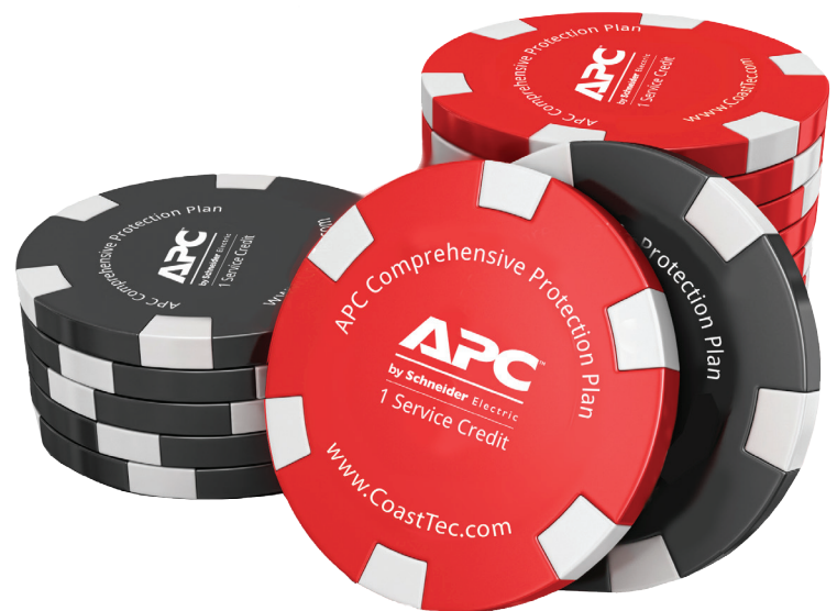
CoastTec CPP – Because downtime is not in your DNA

In addition to ease of fulfillment, the CPP offers purchasing ease. One P.O. covers service for the year. There are no fire drills and you're prepared for anything. We even offer remote monitoring and onsite service.